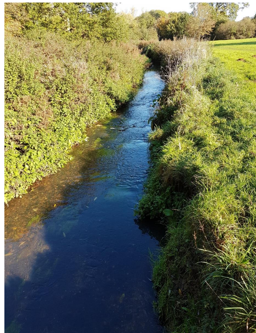
The Emm Brook through Riverside Park

Reconnecting history in Riverside Park: The Loddon Catchment Partnership, the South East Rivers Trust, Friends of The Emm Brook and WBC invite you to come along and talk about the park and proposals for improvements along the river.