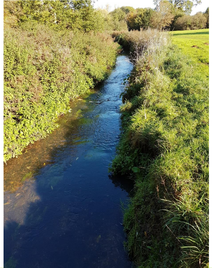
The Emm Brook through Riverside Park

Reconnecting history in Riverside Park: The Loddon Catchment Partnership, the South East Rivers Trust, Friends of The Emm Brook and WBC invite you to come along and talk about the park and proposals for improvements along the river.